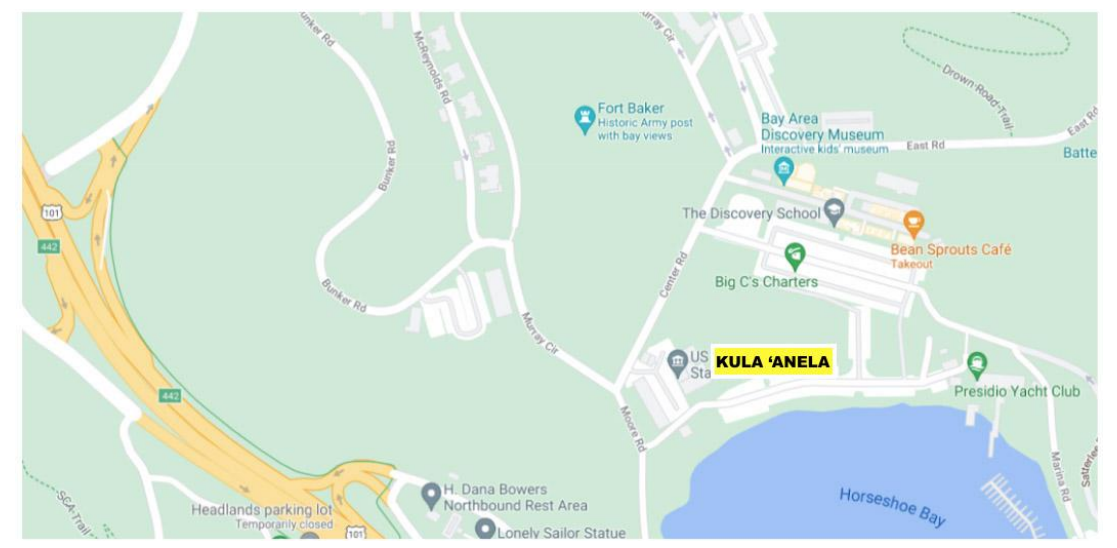
From Northbound Hwy 101, after crossing the Golden Gate Bridge: